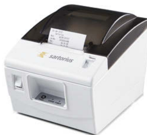
Plug & Play Standard printer YDP40

Two large, easy-to-adjust feet and an outstandingly simple-to-read level indicator on the front make it a breeze for you to level the Practum®. This helps ensure accurate, repeatable weighing results.